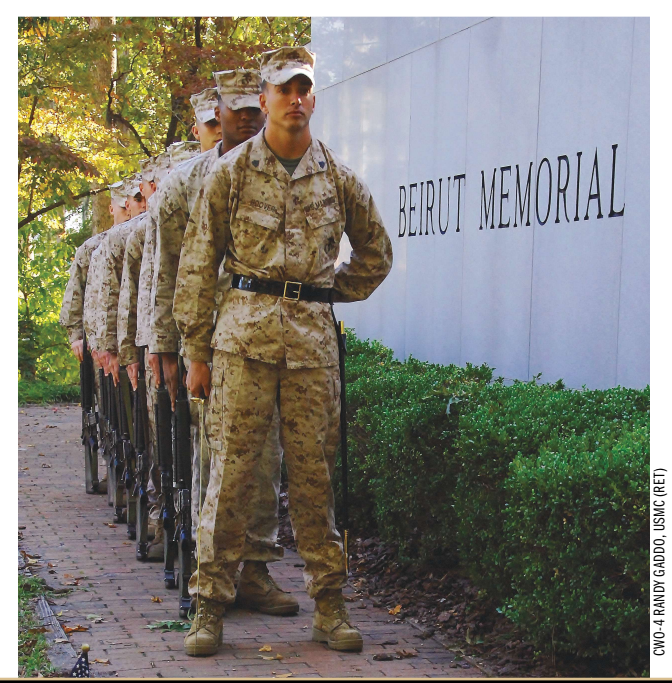
Today's 1/8 Marines reflect the consistent quality of character embodied in Marines of yesterday's 1/8, in the view of the battalion commander in Beirut.