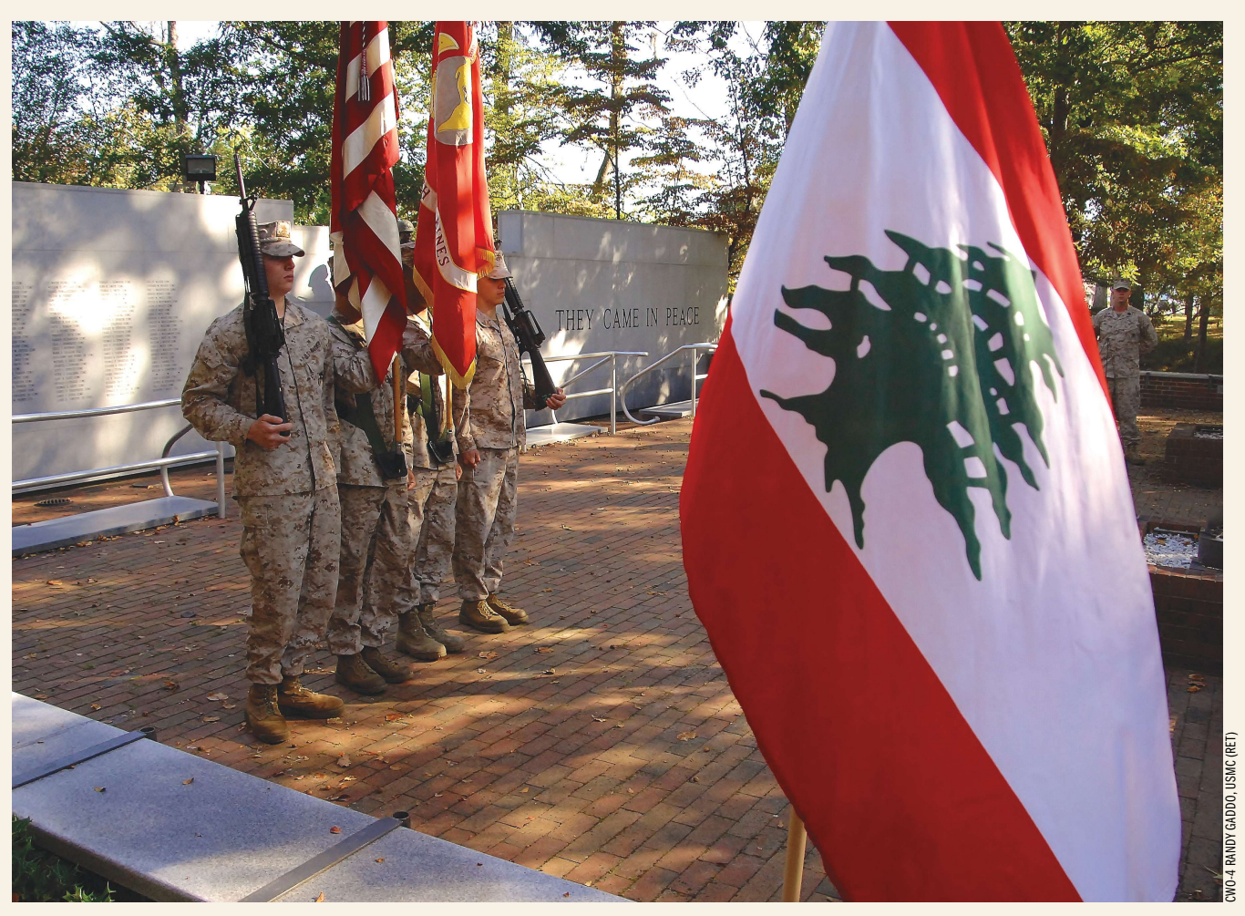
Leathernecks in the 1st Bn, 8th Marines color guard practice prior to the 2012 Beirut Remembrance at the Beirut Memorial, Jacksonville, N.C. In the foreground is the Lebanese flag.