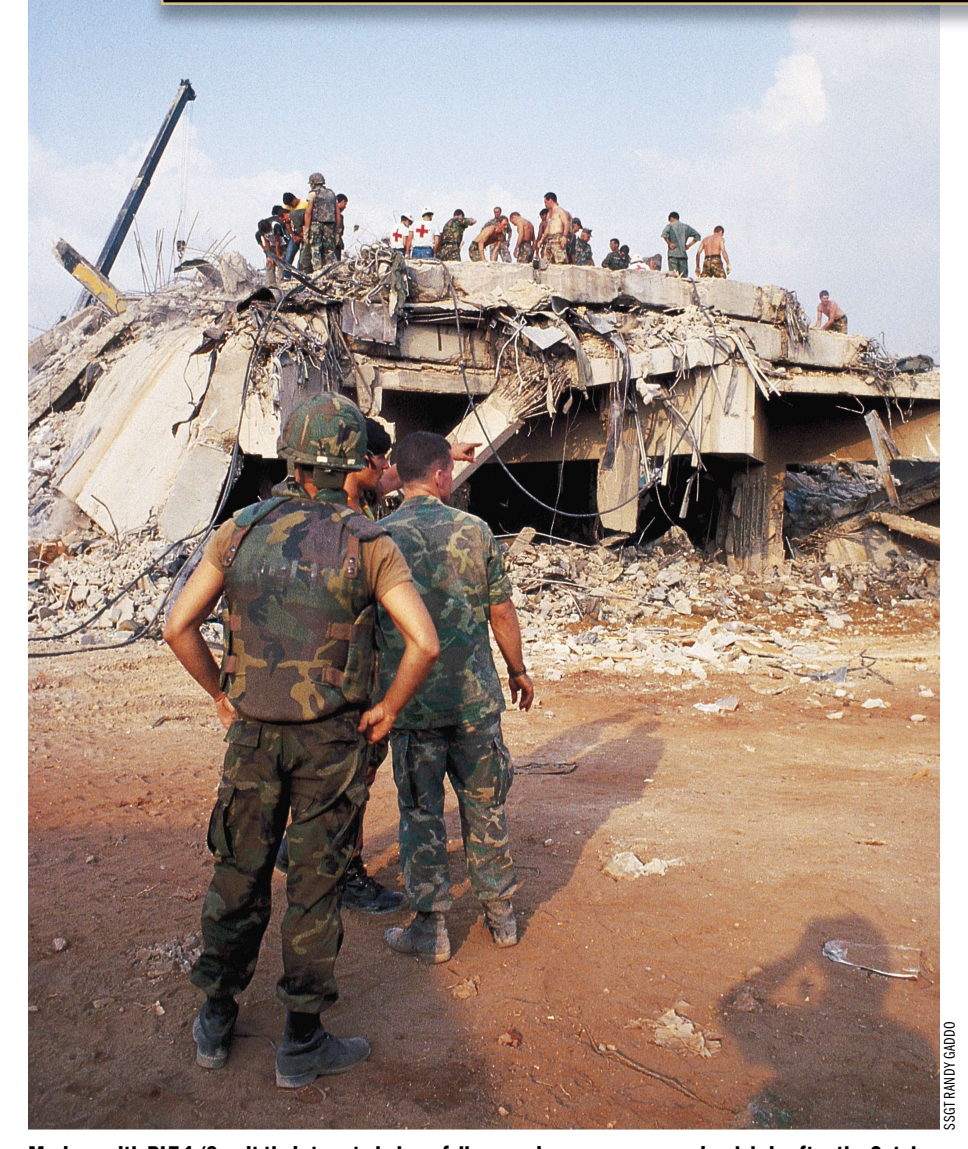
Marines with BLT 1/8 wait their turn to help as fellow servicemen move massive debris after the October 1983 bombing of the Marine barracks in Beirut.

If America and her allies had stood their ground in Beirut after the bombing, could the carnage on American soil on 11 Sept. 2001 have been avoided?